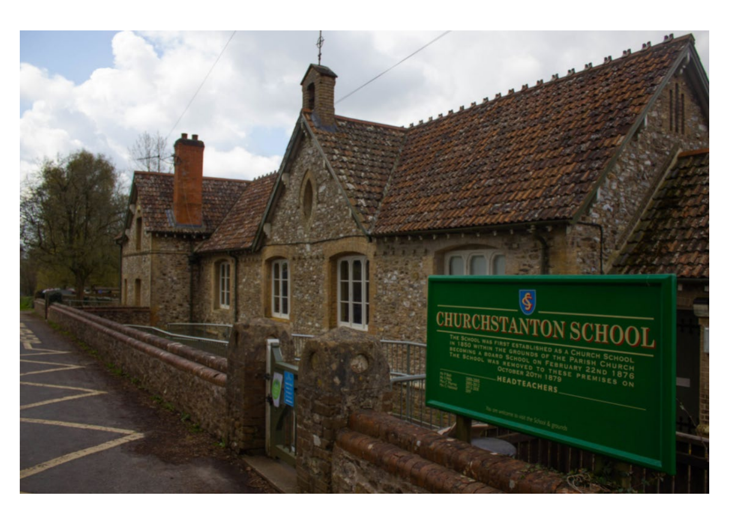
Building respectful, responsible, resilient, risk-takers