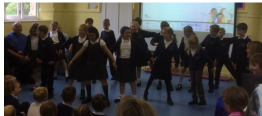
(The children as 'broad beans')

In maths, we have been looking at place value using thousands, hundreds, tens and ones as well as building number lines and discovering different ways to partition a number. We also had a brilliant time learning our harvest song with Ms Berry called 'Bean Harvest' in which we