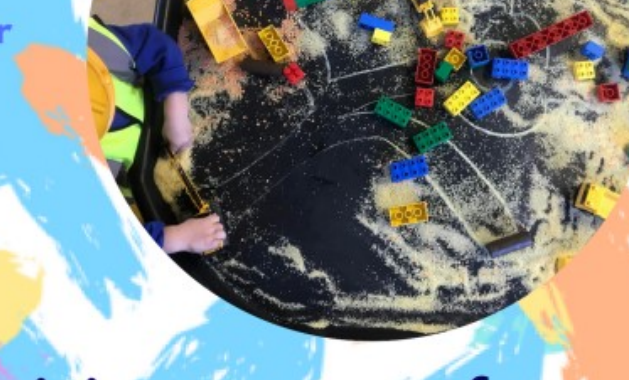
Raising money for a